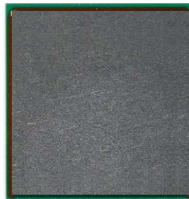
Front of the Sensor